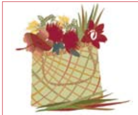
The theme for the conference was Challenges, Creativity and Change , illustrated by this image.

Topics covered were all focused on making a difference in highly demanding work – as varied as mental illness, family violence, bereavements, child protection, eating disorders, grief & loss, cancer and palliative care services. "Papers will be collected and published in a special